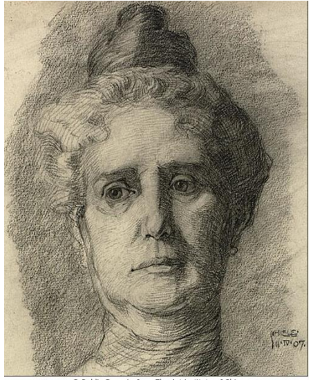
Egon Schiele, 1907