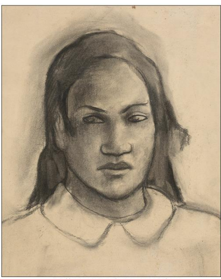
Paul Gauguin, 1891